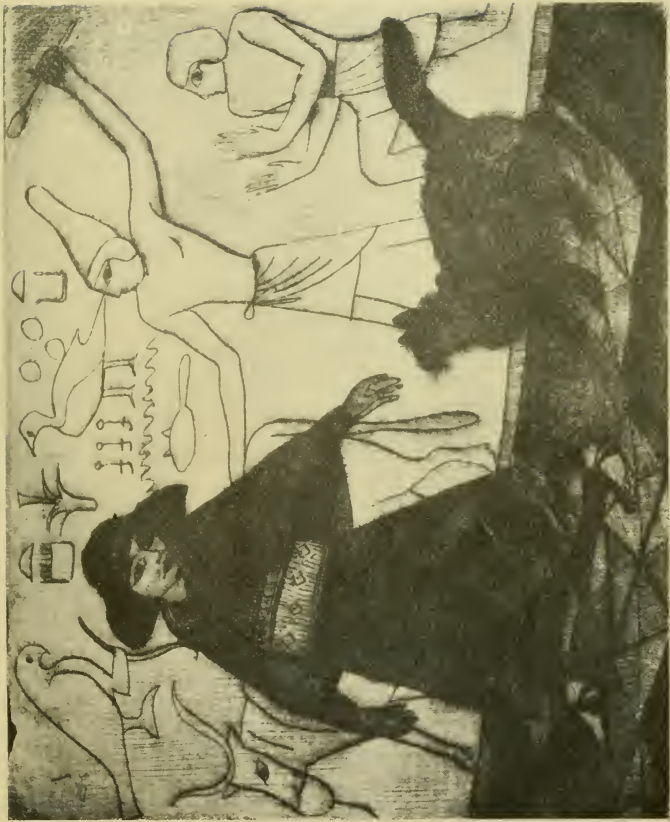
"THROUGH THE LONG CORRIDORS"